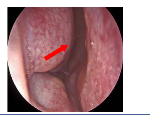
Figure 5: Observation performed with a rigid 0° rhinofibroscope. Significant increase of the vascular submucos (red Arrow).