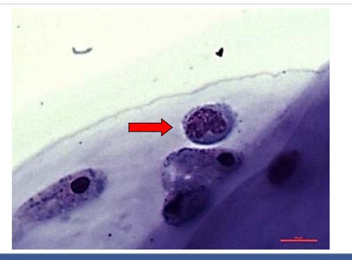
Figure 3: Atypical lymphocytes with Downey II-like (red arrow) cells features showing large size, ample cytoplasm, indented nucleus, and occasional cytoplasmic granules. Magnification at 1000 x oil immersion. Col. MGG.