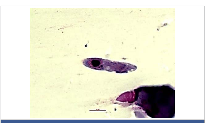
Figure1: "Ciliocytophthoria". Observation by optical microscope. Magnification at 1000 X oil immersion. Col. MGG.

All the subjects recovered by SARS-CoV-2 infection showed atypical and activated lymphocytes, for their features, beyond that cell alterations such as polinucleations and distinctive Ciliocitophtoria (Figure 1). Two types of lymphocytes with different characteristics were highlighted by the cytology observation: a) Plasmacytoid (Figure 2), small mature lymphocytes with an eccentric nucleus and dark blue cytoplasm; this category includes cells with plasmablastic characteristics in which the nucleus is slightly larger with open chromatin and a prominent nucleolus; b ) Downey II-like cells (Figure 3): large lymphocytes, and rare cytoplasmic granules, similar, as morphology, to the original Downey II cells. Moreover, we observed a higher percentage of atypical Plasmacytoid lymphocytes than Downey II. The summary of our findings is reported in Table 1. The rhinofibroscopy technique showed a "psuedoischemia submucosa" in 62% of previously affected by SARS-CoV-2 subjects under our investigation, mostly in the posterior area (Figure 4). Moreover, there is evidence of a significant increase in the vascular submucosa in about 89% of the investigated subjects (Figure 5). These findings were not founded in the subjects of the control group.